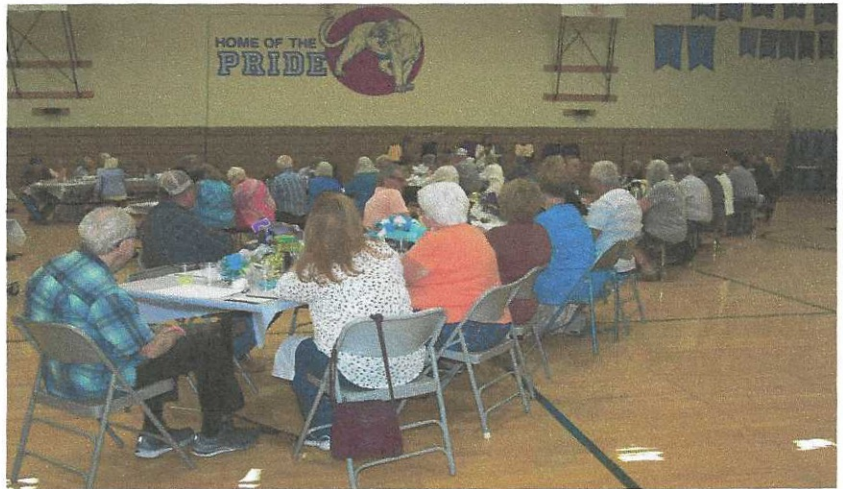
Through the Decades 2023 Reunion was a great success and enjoyed by all who attended.

Our newsletter is sent to over 554 alumni which could bring in over $5000 in dues alone if everyone paid their annual $10 dues. Today we have few paid members. We hope you'll send in your dues today!